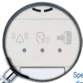
Special model for disabled people