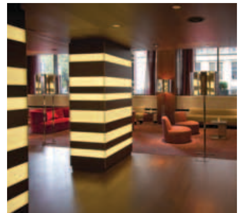
Fully configurable Architectural dimmers suit many applications, such as theatres, ballrooms, function centres, hotels, restaurants and office buildings.