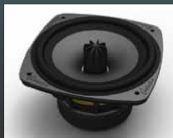
5.25" HIGH-DEFINITION BASS/MIDRANGE DRIVER