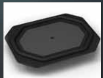
QUADRATIC PLANAR INFRASONIC RADIATOR