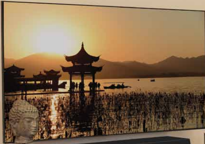
Model shown: SuperCenter XXL

The SuperCenters are high performance center channel speakers appropriate for the highest quality home theater systems. They are designed to perfectly complement and match our Triton Towers and Aon Bookshelf loudspeakers, both sonically and cosmetically. Their sophisticated industrial design is both attractive and functional, both minimizing their apparent size as well as enhancing their acoustic performance.