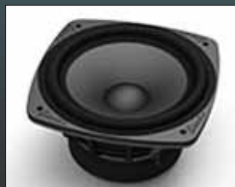
5.25" HIGH-DEFINITION BASS/MIDRANGE DRIVER (XXL)